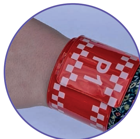
User friendly design with felt back for patient comfort

This is why Metafont Ltd is now supplying NHS ambulance services, Police and Fire & Rescue services with their 100% FULLY NHSE-compliant Metafont Ten Second Triage TST and NHS MITT Solutions – from just £0.74 each!