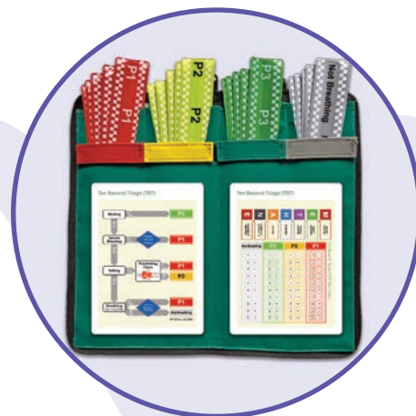
Triage Band Carry Pack